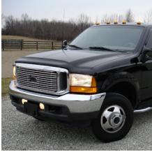
Gas and Diesel Fleets