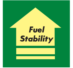
Better Fuel Stability and Longevity