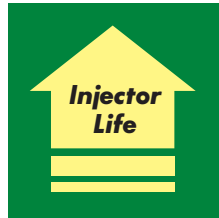
Increased Injector Life