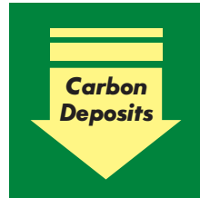
Reduced Combustion Chamber Deposits