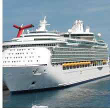
Boats and Ships