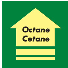
Higher Octane and Cetane Ratings