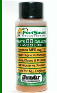
2 Oz Bottle Treats 80 Gal Gas or 50 Gal Diesel