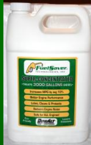
Gallon Bottle Treats 5,000 Gal Gas or 3,000 Gal Diesel