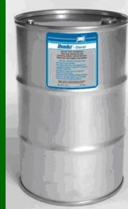
55 Gallon Drum Treats 275,000 Gal Gas or 165,000 Gal Diesel