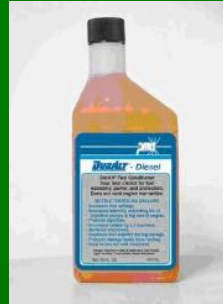
16 Oz Bottle Treats 640 Gal Gas or 368 Gal Diesel